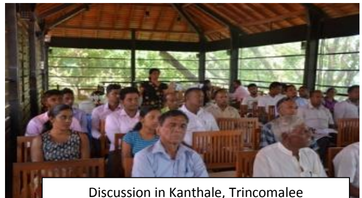
Discussion in Kanthale, Trincomalee