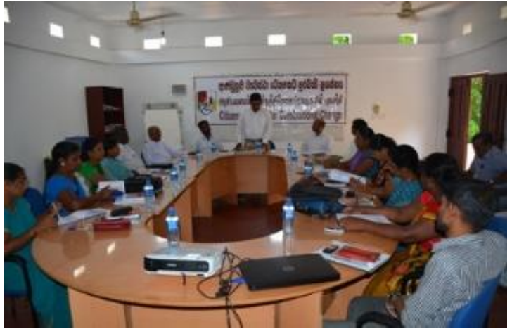
Discussion in Akkaraipattu, Ampara