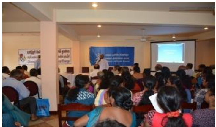
Discussion in Kandy