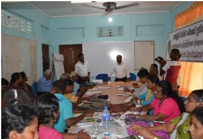
Discussion in Batticaloa