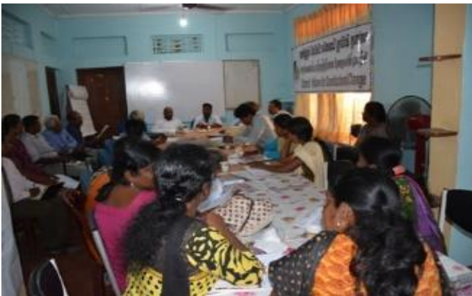
Discussion in Batticaloa