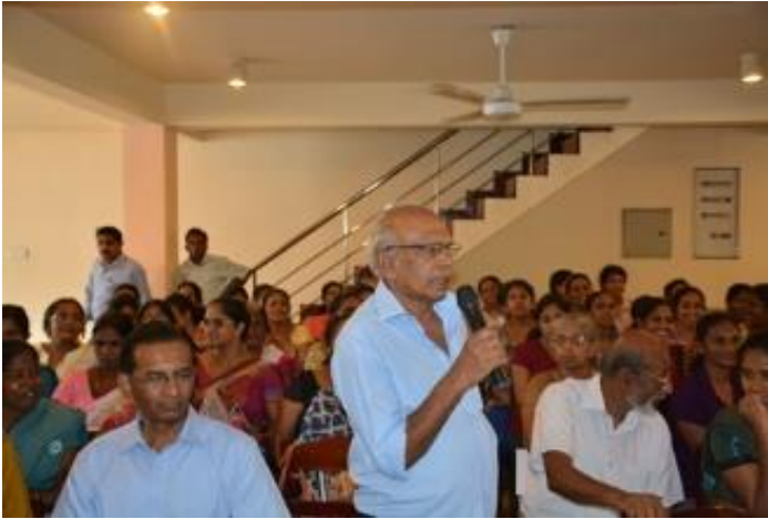
Discussion in Kandy