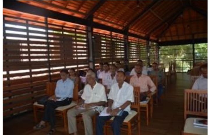
Discussion in Kanthale, Trincomalee