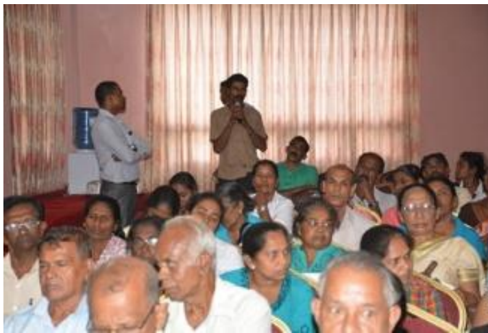
Discussion in Matale