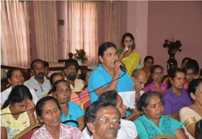
Discussion in Matale