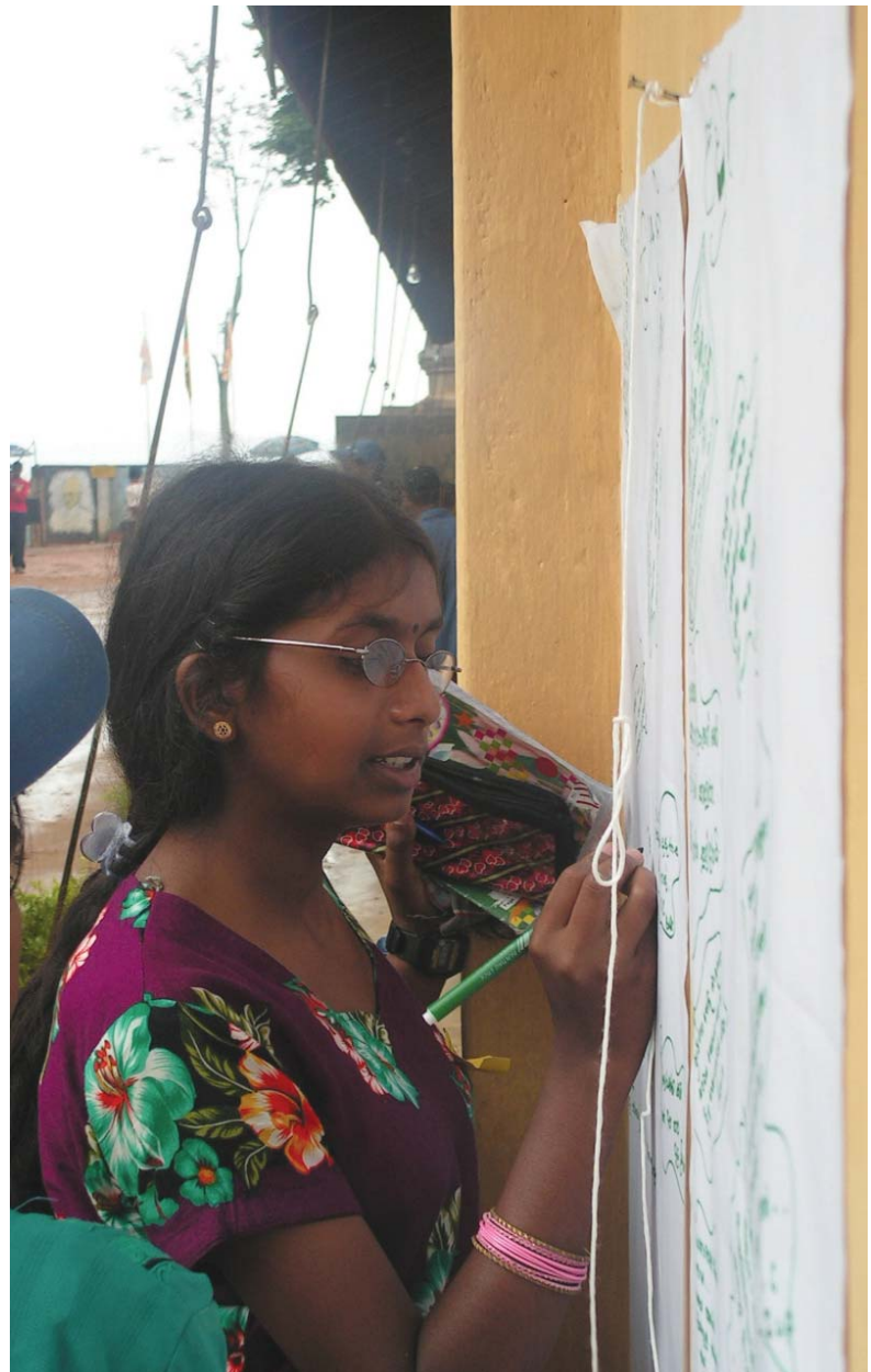
A student adding beauty of her thoughts to the Mirror Wall at Ba/Zarniya Vidyalaya