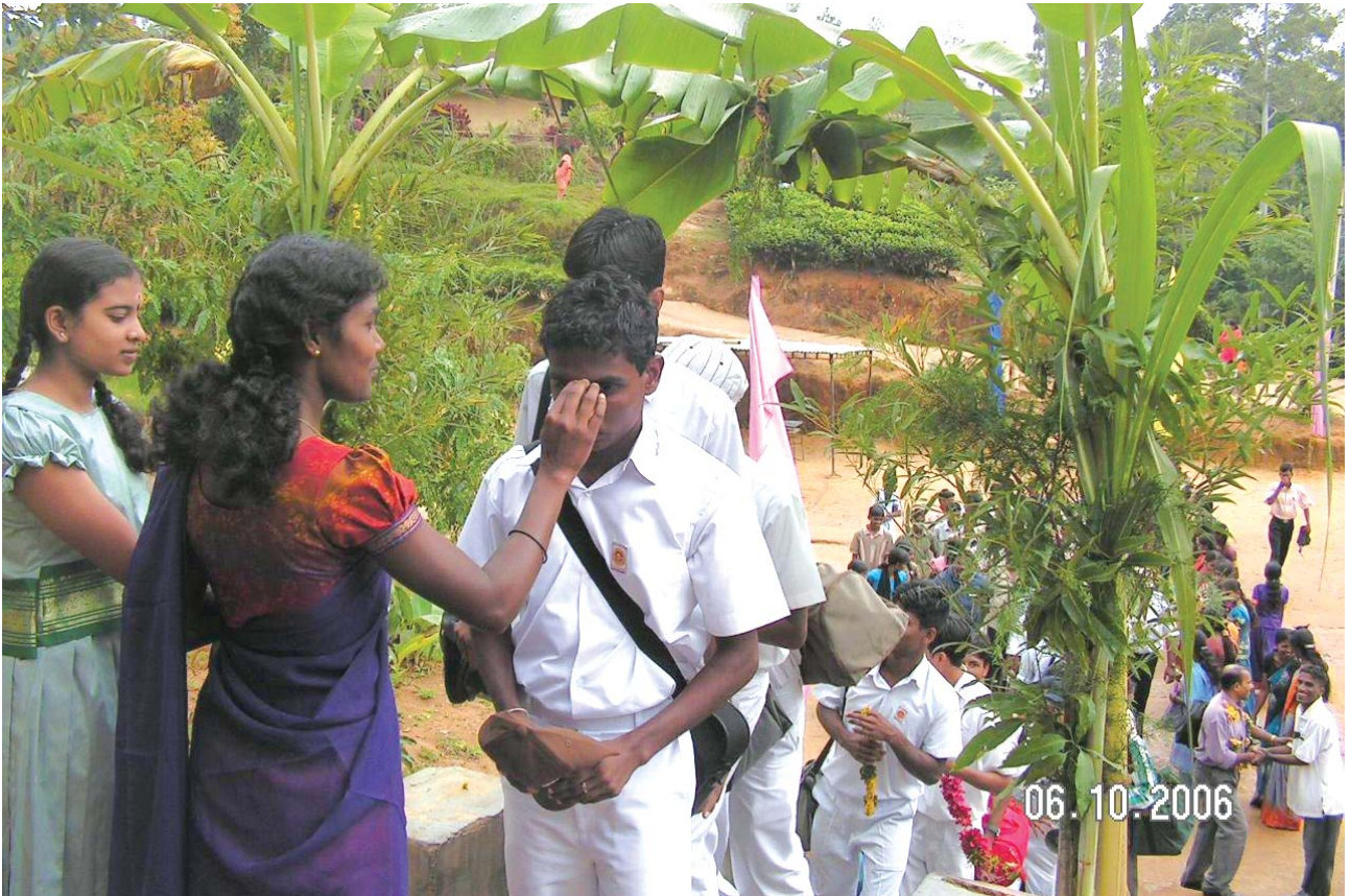
Students of Bloomfield Vidyalaya giving a traditional welcome to the invitee students of Ku/Hindu Tamil Vidyalaya