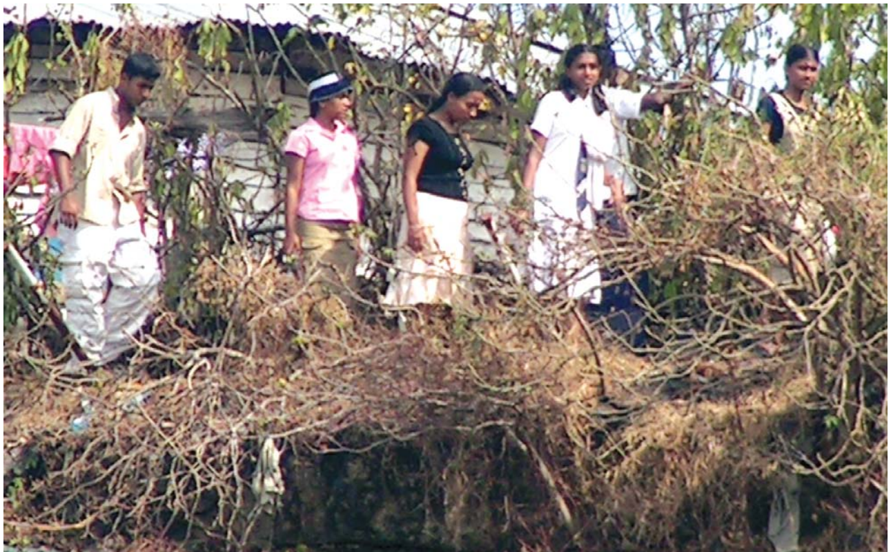
At the Camp held at Ku/Hindu Tamil Vidyalaya, students of Passara Tamil Vidyalyala and Athugalpura Vidyalaya in their Field Trip