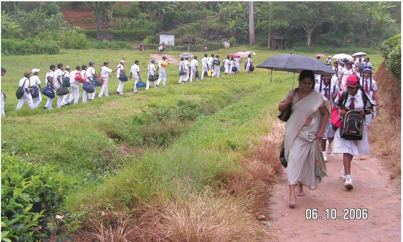
Students and teachers of Athugalpura Vidyalaya arriving the Camp held at Maskeliya Bloomfield Vidyalaya