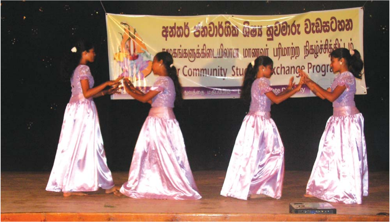
A dance performance – cultural show of the Camp held at A/Zahira Vidyalaya