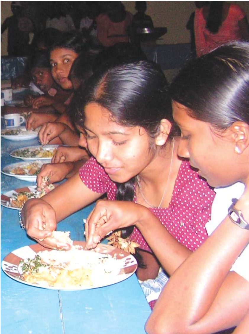
Students sharing their dinner at the Camp held at Am/Galahityagoda Vidyalaya.