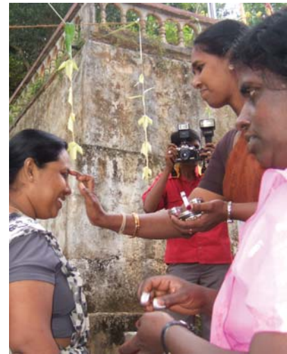
The Student Camp Experience.... The Way We Felt .....