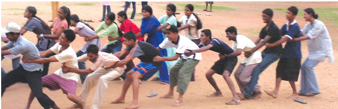
අ/තරුල්වන්ද ම.වී. පැවති කඳවුරේ දී ක්‍රීඩාවේ යෙදෙන සිසු සිසුවියන් පිරිසක්