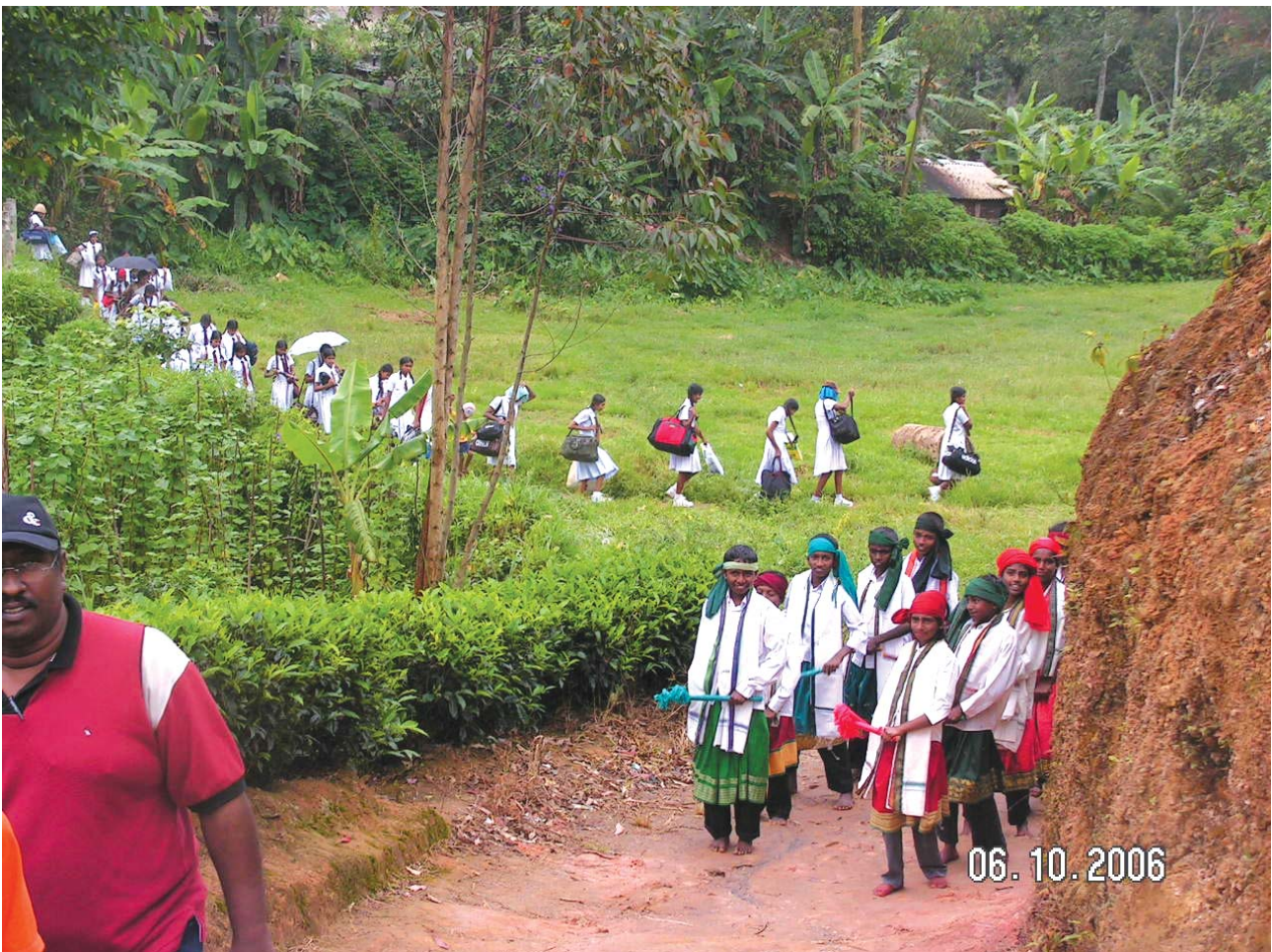
Students of Bloomfield Maha Vidyalaya awaiting to welcome the Athugalpura Students

The Bloomfield school premises appeared a most picturesque scene with the arrival of Athugalpura students.