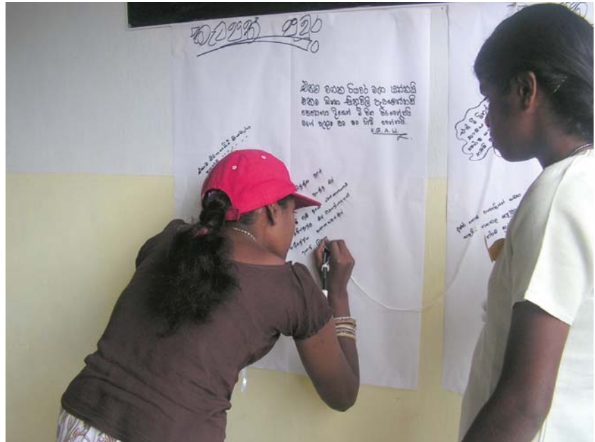
A student scribbling her thoughts on Mirror Wall

Are taken away from them by the war? If the lives of Sinhala brothers and sisters Are taken away from them by the war? Is it victory? They are the brothers and sisters of this nation, Sri Lanka So, aren't we all losers?