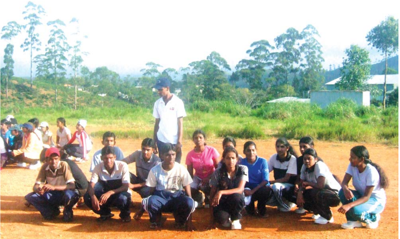
Students about to start sports activities at the Camp held at Hatton Highland Vidyalaya