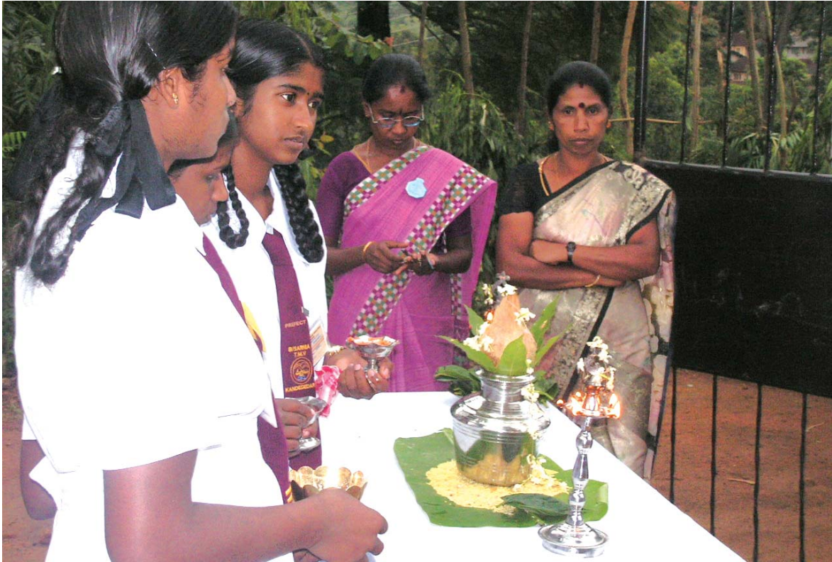
Students and teachers of Zarnia Vidyalaya awaits to welcome the invitees according to their traditional customs