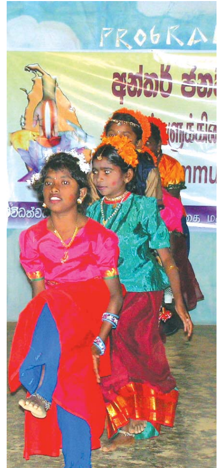
Students of Maskeliya Bloomfield College performing a traditional dance at the cultural show.

The second day of the camp started with fitness activities while the second phase was the Feiled Trip, which was followed by lunch.