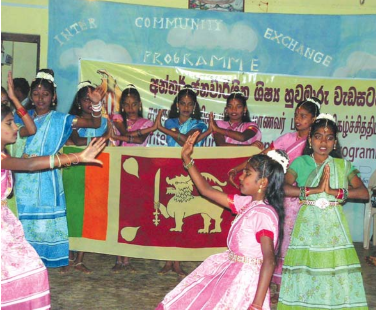
Students of Bloomfield Vidyalaya performing a dance item