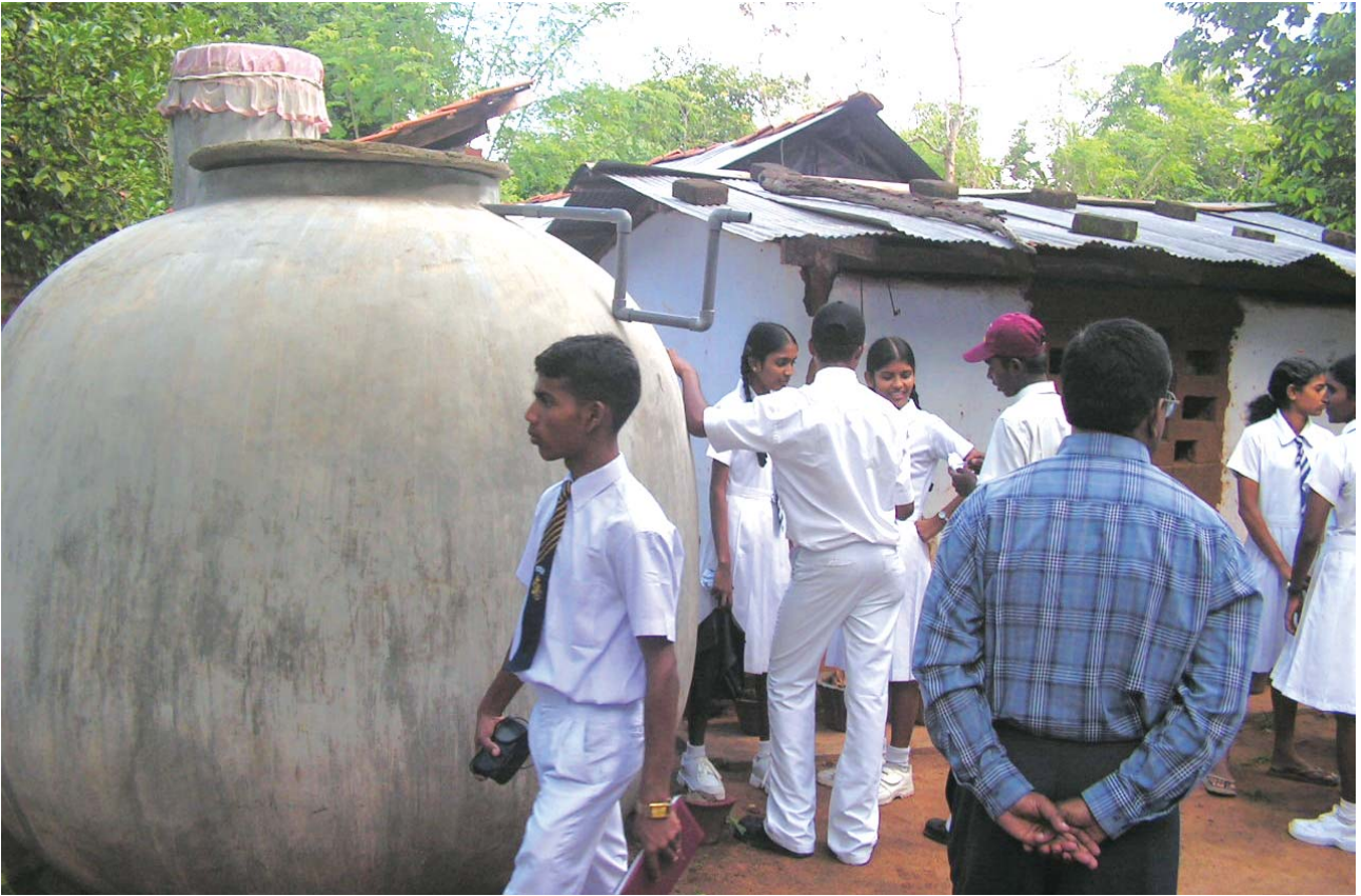
Students who took part for the Field Trip at the Camp held at Harischandra Maha Vidyalaya visiting a house at Kukulewa area