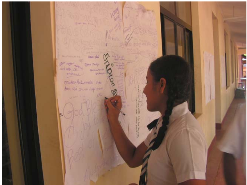
A student adding her thoughts at Walisinghe Harischandra Vidyalaya

Let us flow together Like a limitless river K.C.C. Boys