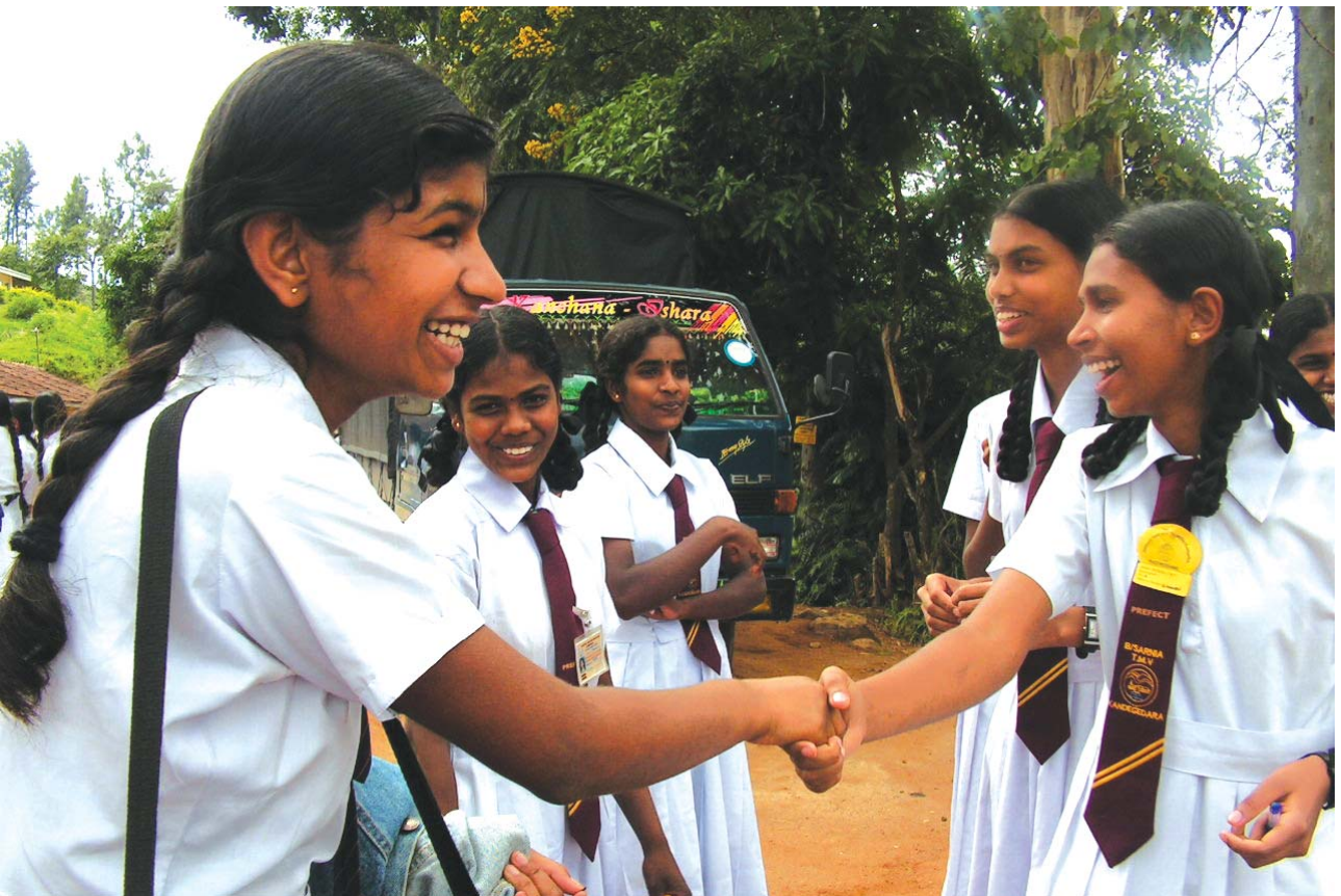
A student of Karagaskada Vidyalaya bids adieu to another student of Ba/Zarniya Vidyalaya at the end of the Camp.