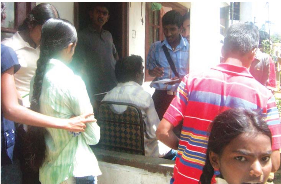
Field Trip by students from the Camp held at Highland Vidyalaya

Students engaged in sports activities after the presentation and a beautiful cultural show went onboard in the evening. The Third day of the Camp was started off with a ‘Sharamadana’. Students and teachers were given the opportunity to voice their opinions and experiences marking the finale of the Students Camp. The three-day Camp was concluded after having lunch.