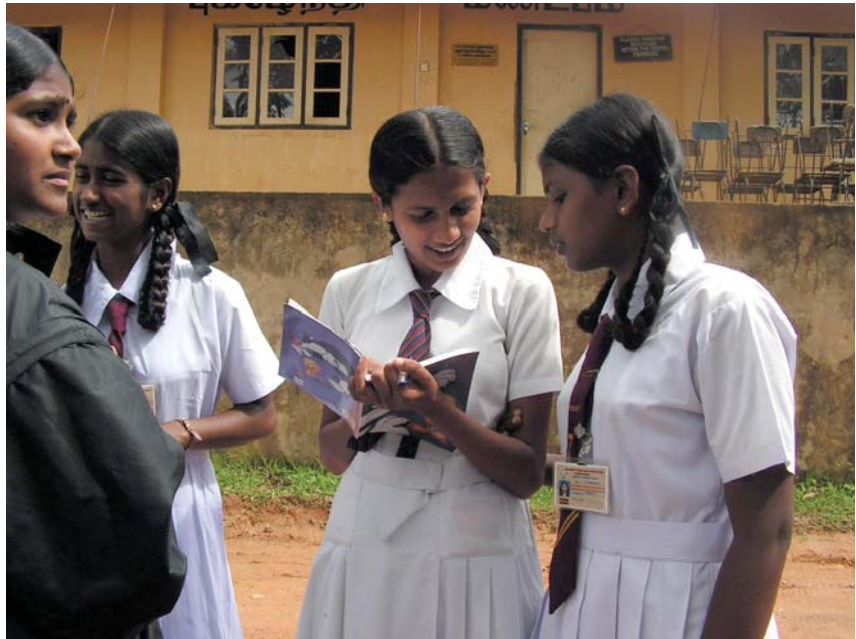
Autographing beautiful memories prior to departure