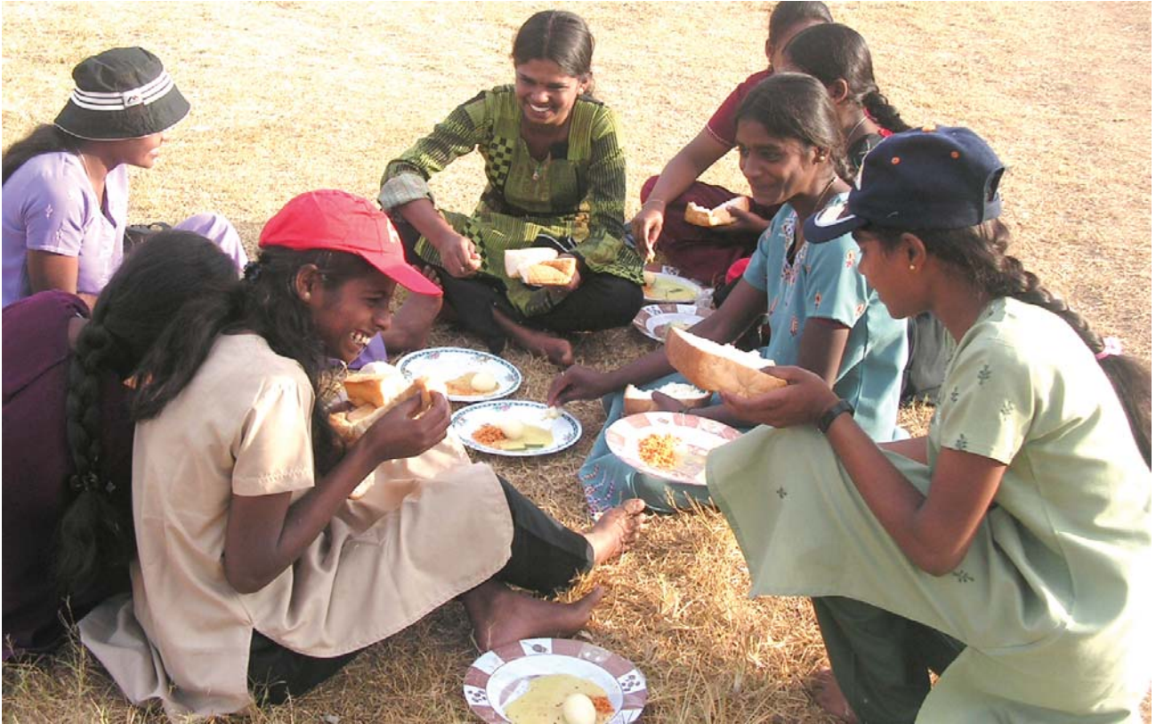
A group of Paasara Tamil Vidyala students having their lunch at Ku/Hindu Tamil Maha Vidyalaya sports ground