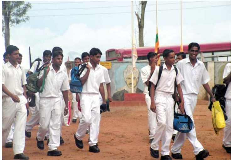
Schoolboys of K/Karagaskada Vidyalaya arriving the Camp held at Ba/ Zarniya Vidyalaya

The cultural festival began around 7.30 p.m. Students comments on the last day of the Camp are as follows;