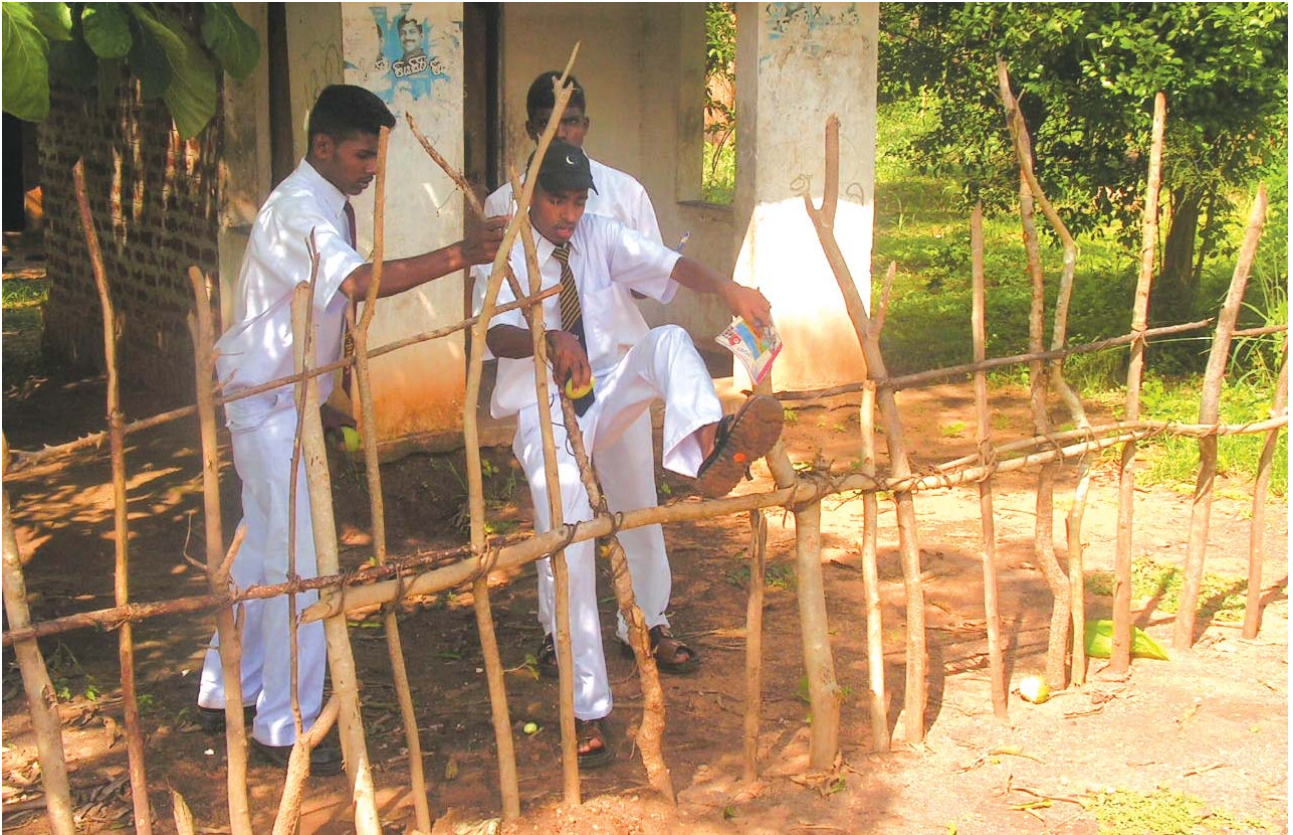
Students of Passara Tamil Vidyala in their Field Trip at the Camp held at A/Harischandra Vidyalaya