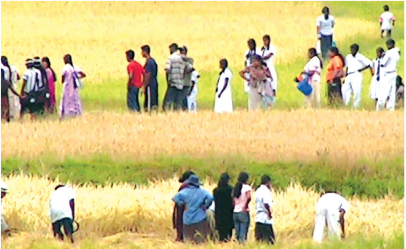
Student's experience paddy harvesting as a part of their Field Trip at the Camp held at Ku/Hindu Tamil Vidyalyaya