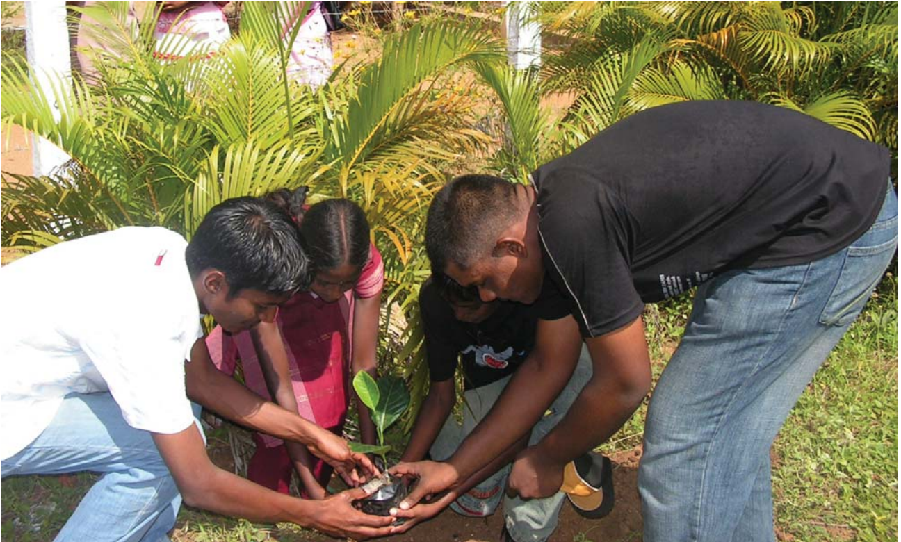
Students of Ku/Hindu Vidyalaya, Matale Mahabedda Maha Vidyalaya, A/Vivekananda Vidyalaya and A/Zahira Vidyalaya planting a commemoration tree at the Camp held at A/Zahira Vidyalaya