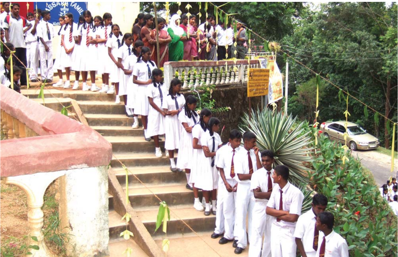
At the Camp held at Passara Tamil Maha Vidyalaya, students and teachers of Passara and Lunugala Tamil Maha Vidyalaya waiting to welcome the invitee schools