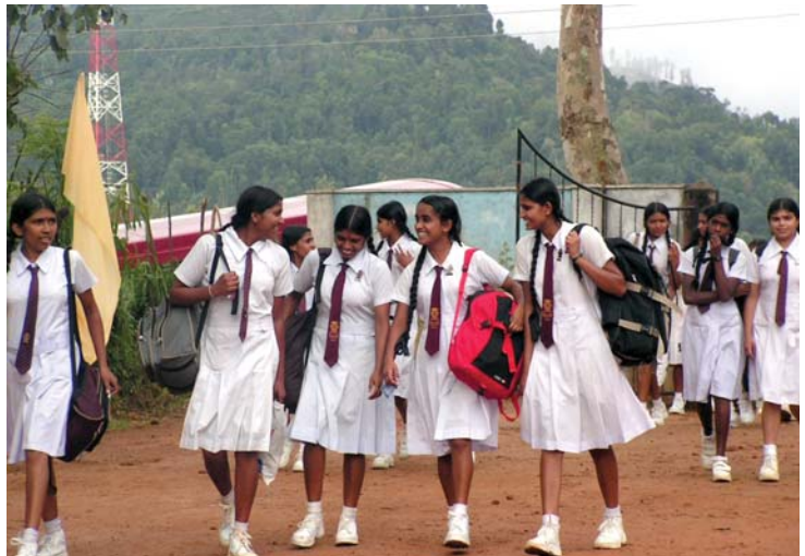
Schoolgirls of K/Karagaskada Vidyalaya arriving the Camp held at Ba/ Zarniya Vidyalaya