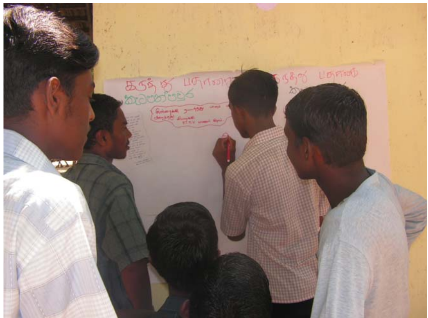
Scribbling for the Mirror Wall

The cold breeze The resonance of birds Enchanting Like flowers blossomed in grassland Shining together