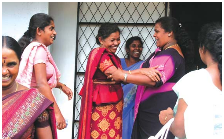
Teachers who came to Badulla from Senkadagala Puravara sharing a moment of happiness