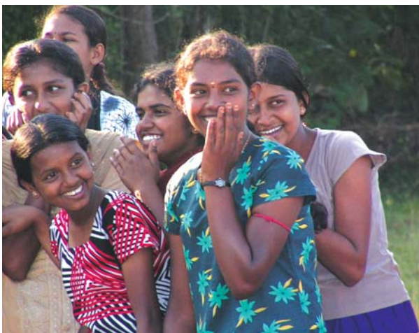
Students in a delightful mood at the Students Camp held at the Galahitiyagoda Maha Vidyalaya in Ampara