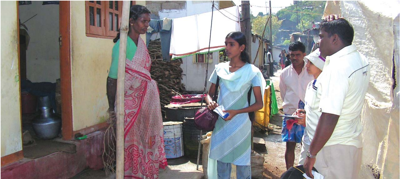
Field Trip to Bloomfield Estate by students from Athugalpura