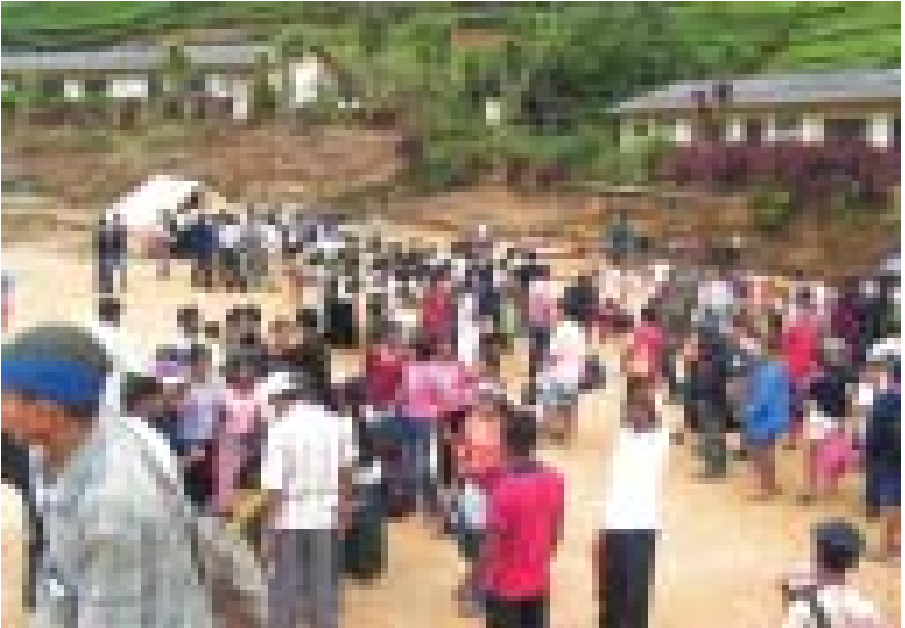
Students of Bloomfield Vidyalaya bids adieu to Athugalpura Student