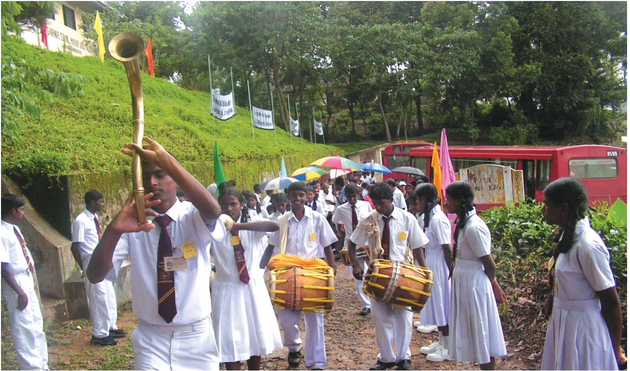
School Band of the Ba/Zarniya Maha Vidyalaya escorting the invitee schools