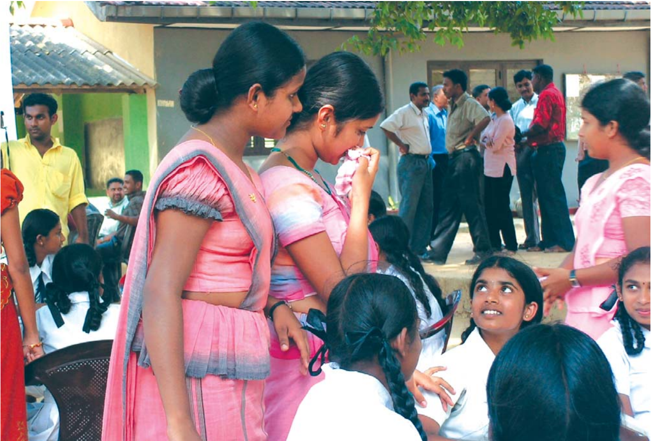
Students of Am/Galahitiyagoda Vidyalaya and Paasara Tamil Maha Vidyalaya in conversation