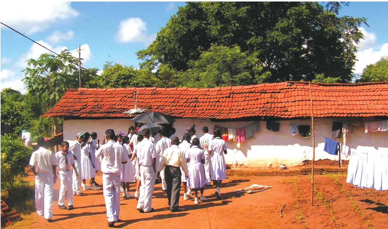
Field Trip to Anuradhapura Kukulewa area.

You have hope but these people don't. They are suffering from the war situation. Yet we were able to develop strong friendships amidst all these bitter experiences and I wish for an everlasting bond with them.