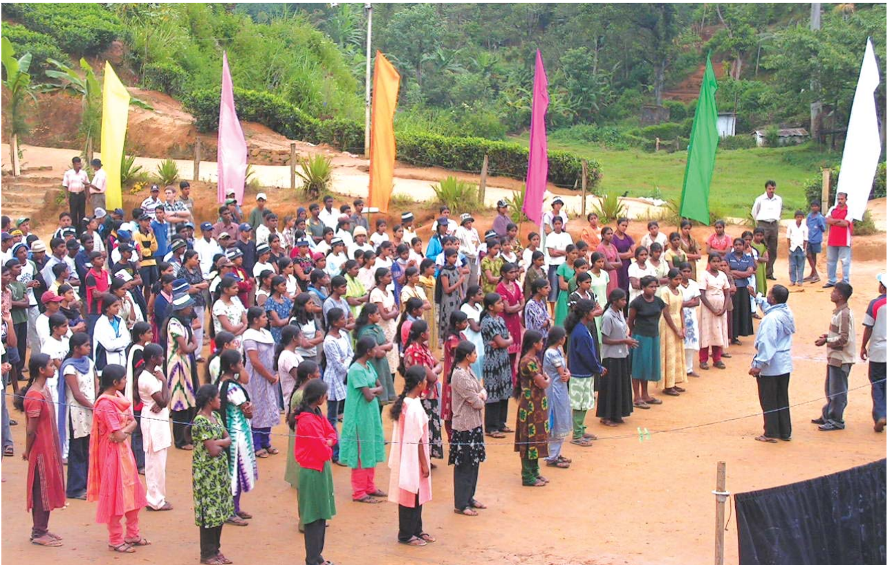
Receiving advice and guidance before leaving on the Field Trip at the Students Camp held at Maskeliya Bloomfield Vidyalaya