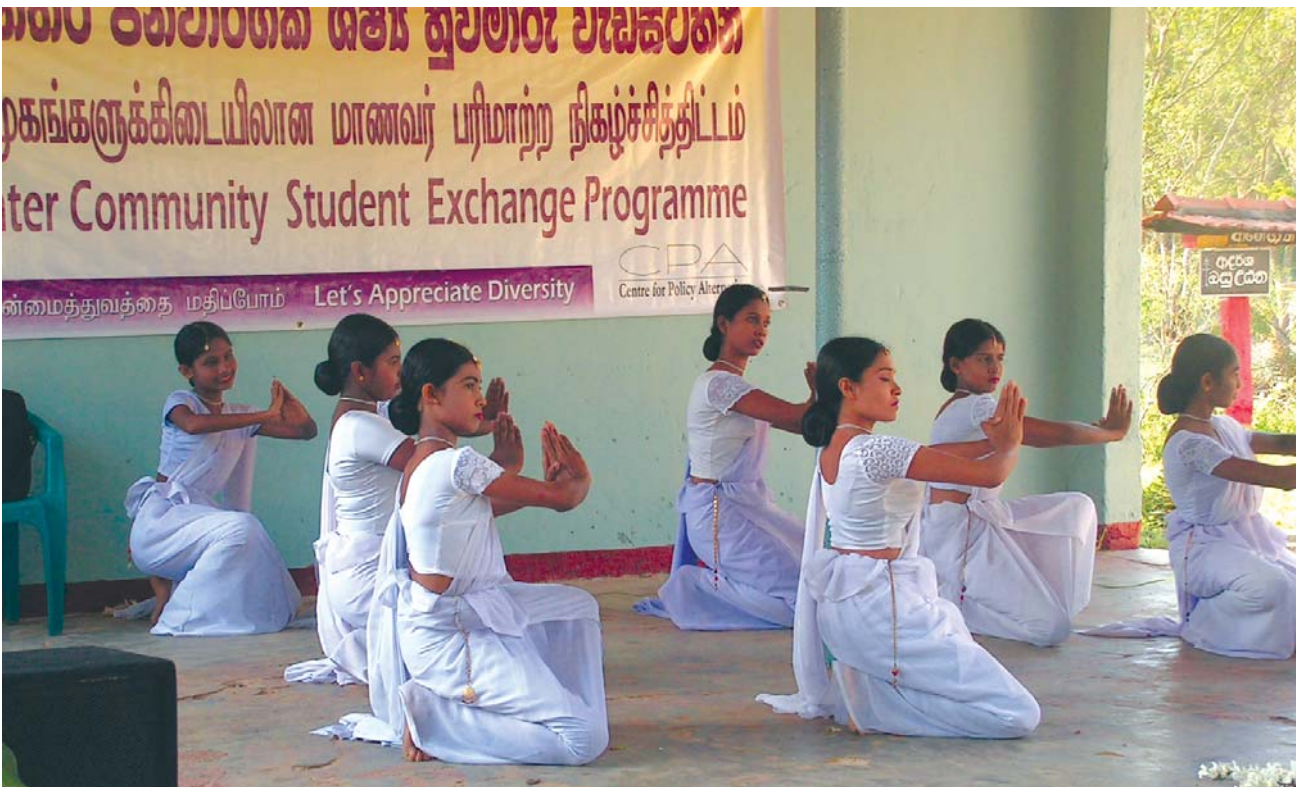
The welcome dance performed by the students of Am/Galahitiyagoda Maha Vidyalaya