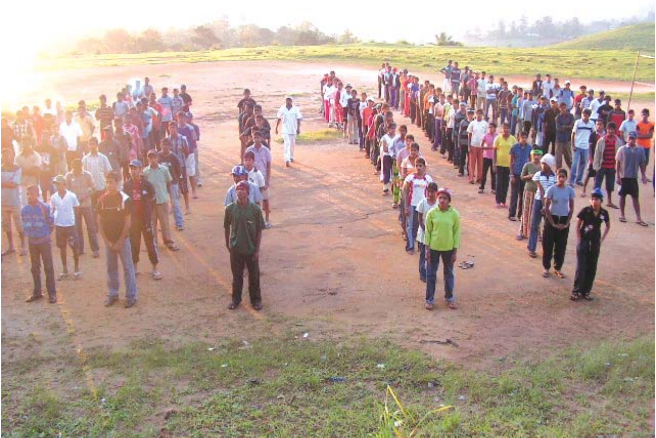
Students engaged in fitness exercise starting the day at the Camp held at K/Karagaskada Vidyalaya