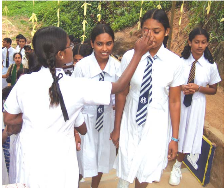
MARKING A POTTU at the Student Camp held at Passara Tamil College, the students of the school giving a traditional welcome to their fellow students from Anuradhapura Walisinghe Harischandra Vidyalaya.

There were seven Student's Groups in this first Programme. They were given the opportunity to perform their talents by engaging in various kinds of activities and the opportunity to experience estate sector Tami people's less privileged lifestyle as well as to better understand the religious and cultural life patterns of them.