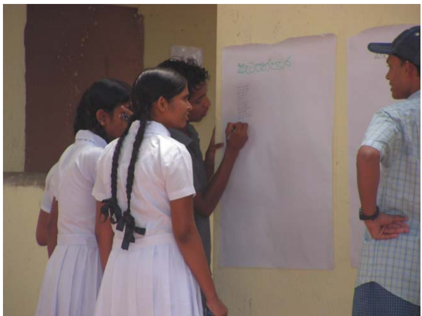
Adding a note of camaraderie to the Mirror Wall

Flowers we are In search of space to blossom The only way to escape From the racist devil Is to move ahead Step by step In the path of peace Niluka Monaragala Madi Viduhala.