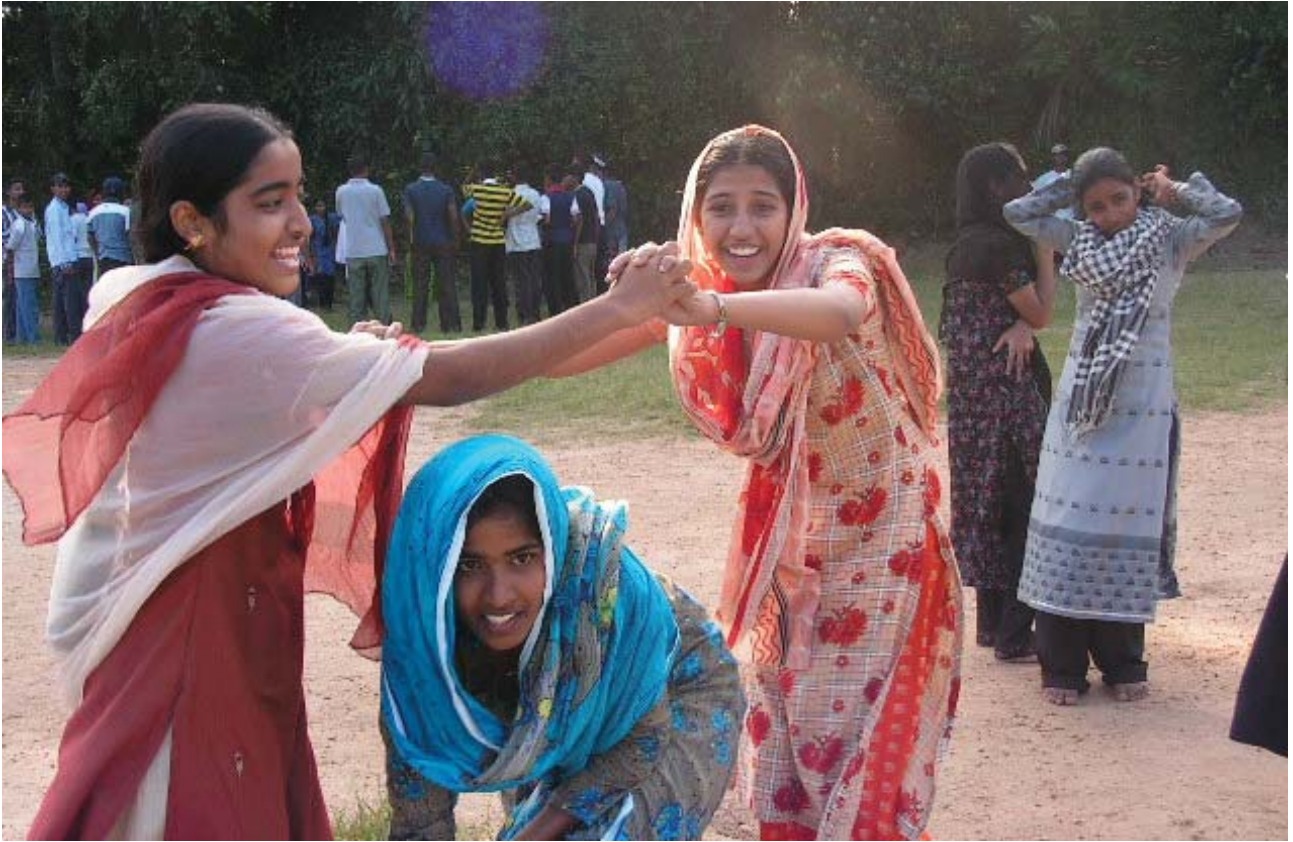
A group of invitee students enjoying sports activities at the Camp held at Madulla Madya Maha Vidyalaya