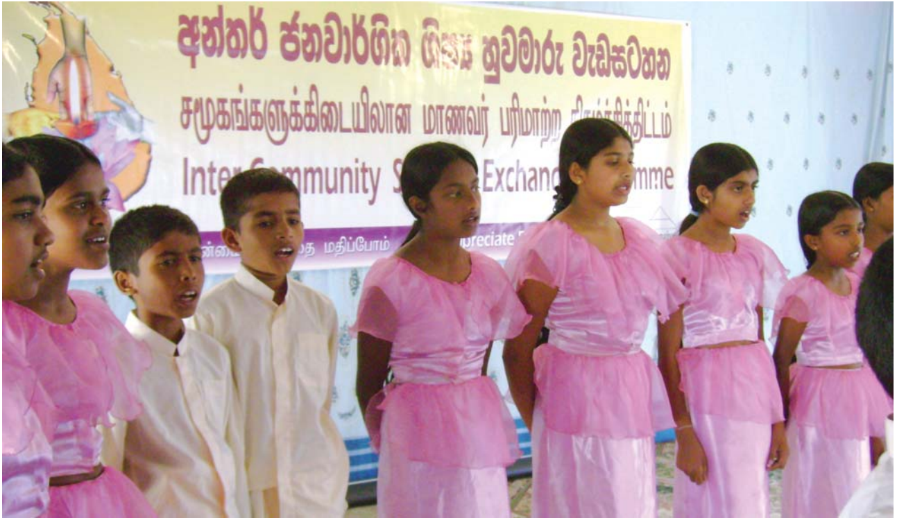
At the Camp held at K/Karagaskada Vidyalaya, students of the school singing the national anthem celebrating the 59 th anniversary of the Independence Day.