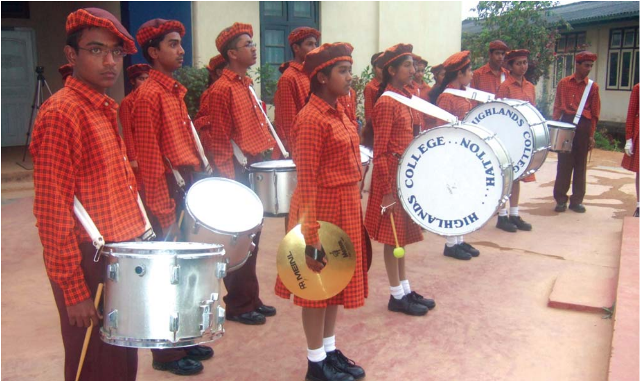
School Band of Highland Vidyalaya ready to welcome their guest invitees