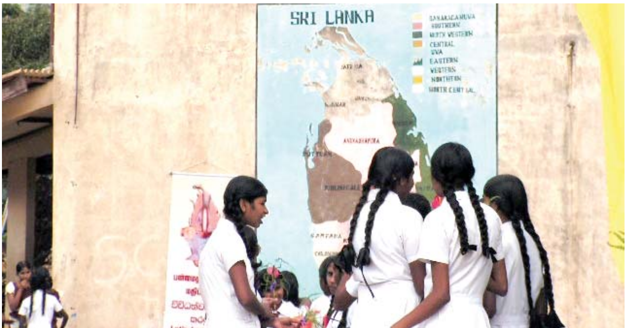
Students in conversation enjoying a break at the Camp held at K/Karagaskada Vidyalaya