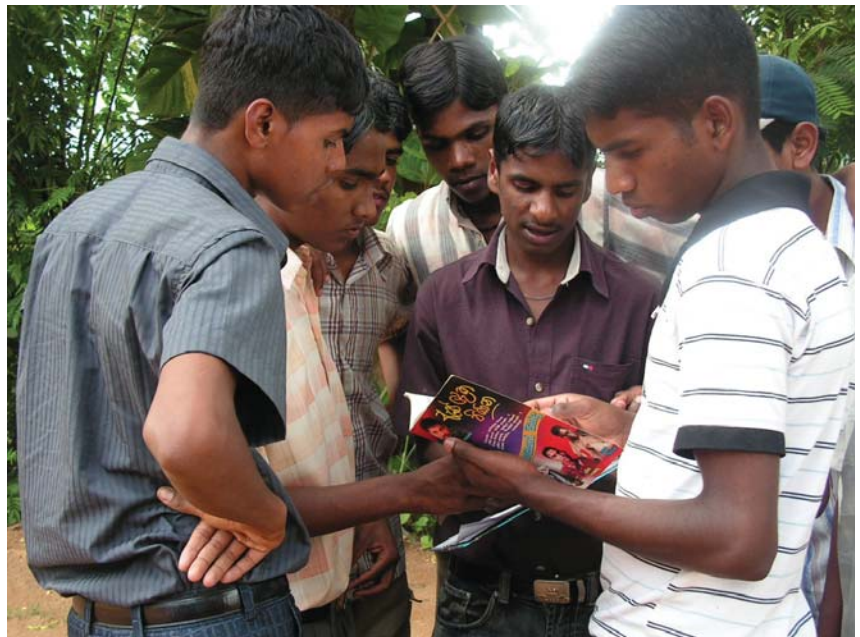
Just before saying 'good bye'