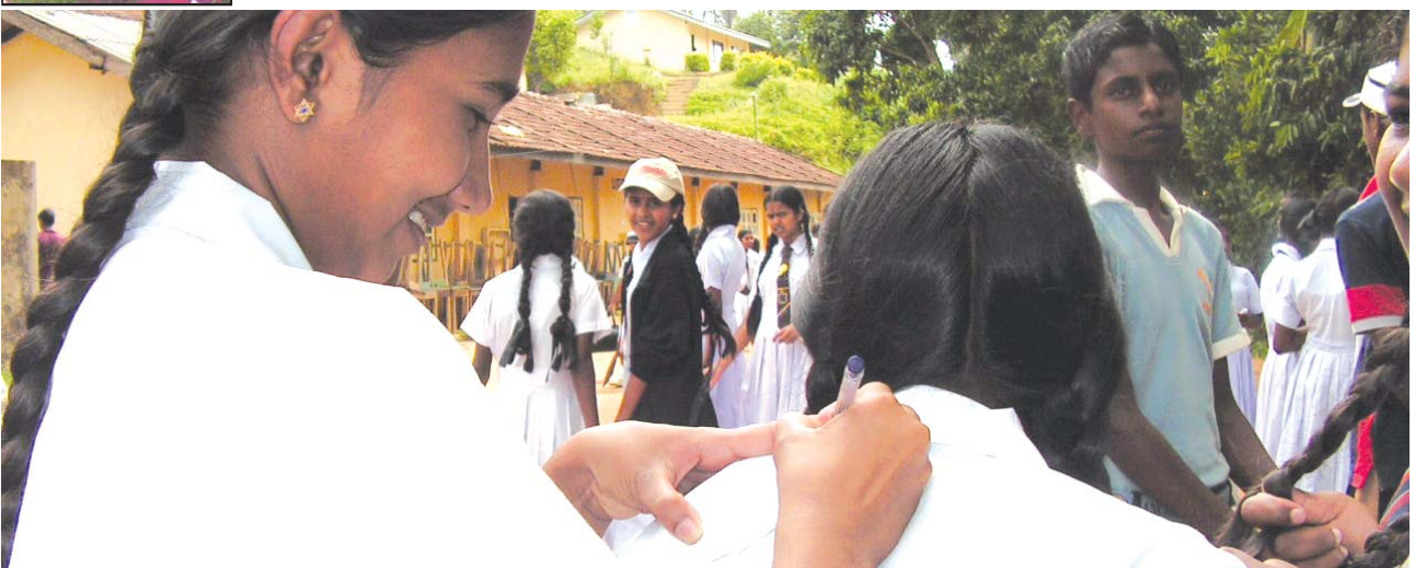
At the end of the Camp held at Ba/Zarnia Vidyalaya a student of Karagaskada Vidyalaya scribbling her greetings for a fellow colleague

We should respect diversity and for that children of different ethnicities should be given the opportunity to exchange their emotions and ideas. The success of this Programme would be based on continuation of the friendships which bloomed during these three days.