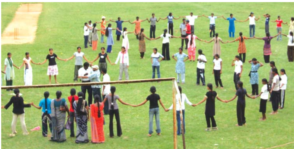
The team engaged in sports activities at the Camp held at Passara Tamil College

Labour resources of Sri Lankan youth have not been made use of to the maximum. The future should be planned with a proper vision engaging this youth. Children are the foundation of future development. This Programme is a support for those children to learn noble human virtues such as tolerance towards diversity, which is something additional to their knowledge from the textbooks. The total support is provided through the Charter of Education to enforce peace.