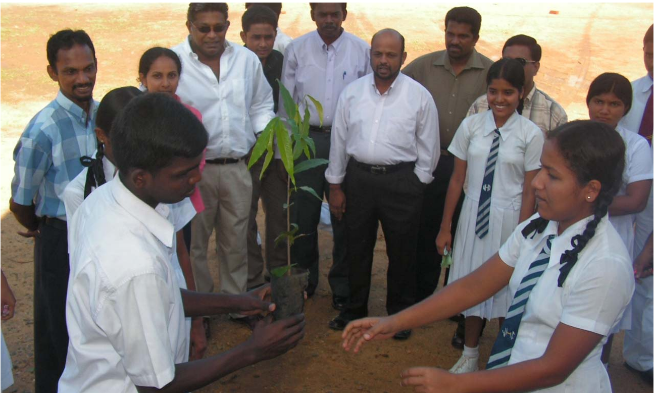
A student of Passara Tamil Maha Vidyalaya offering a commemoration plant to the invitee school at the commemoration tree planting session held at A/Harischandra Vidyalaya